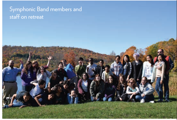
Symphonic Band members and staff on retreat