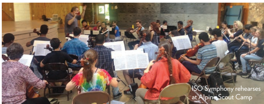
ISO Symphony rehearses at Alpine Scout Camp