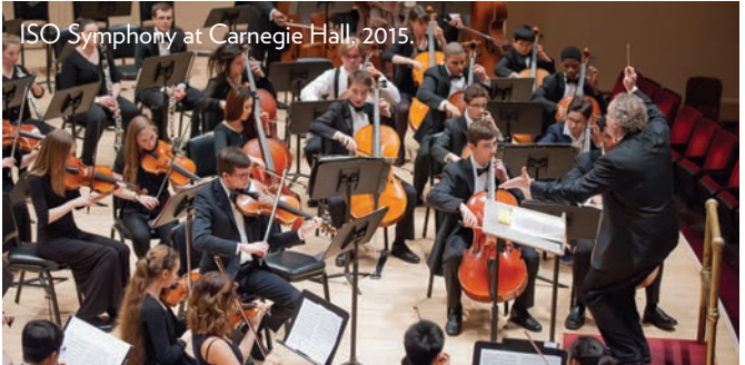
ISO Symphony at Carnegie Hall, 2015.