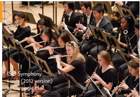
ISO Symphony winds (2012 version) at Carnegie Hall.

May 15: OPERA 360 Concert: Carnegie Hill, Morningside/Queens East, and Turtle Bay/Trinity Florentine Orchestras, Symphony Space, 4:00 p.m.