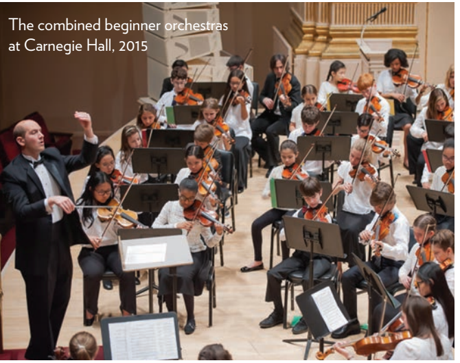
The combined beginner orchestras at Carnegie Hall, 2015