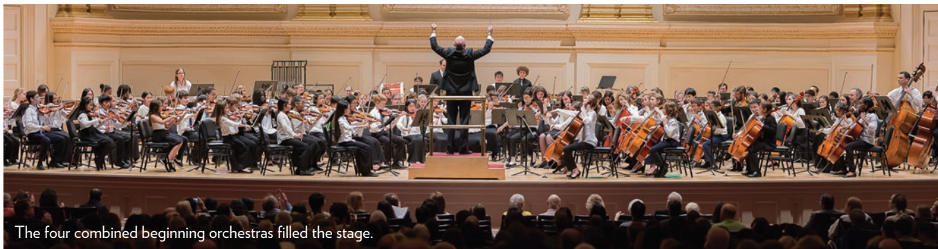
The four combined beginning orchestras filled the stage.

NEWSLETTER OF THE INTERSCHOOL ORCHESTRAS OF NEW YORK • SPRING 2015