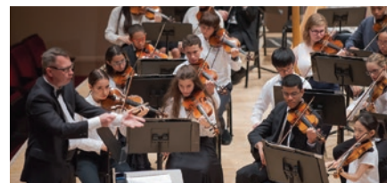
L-R: Symphonic Band; ISO Symphony rehearses with Richard Stoltzman; Concert Orchestra

More pictures of the event can be found on ISO's Flickr page.